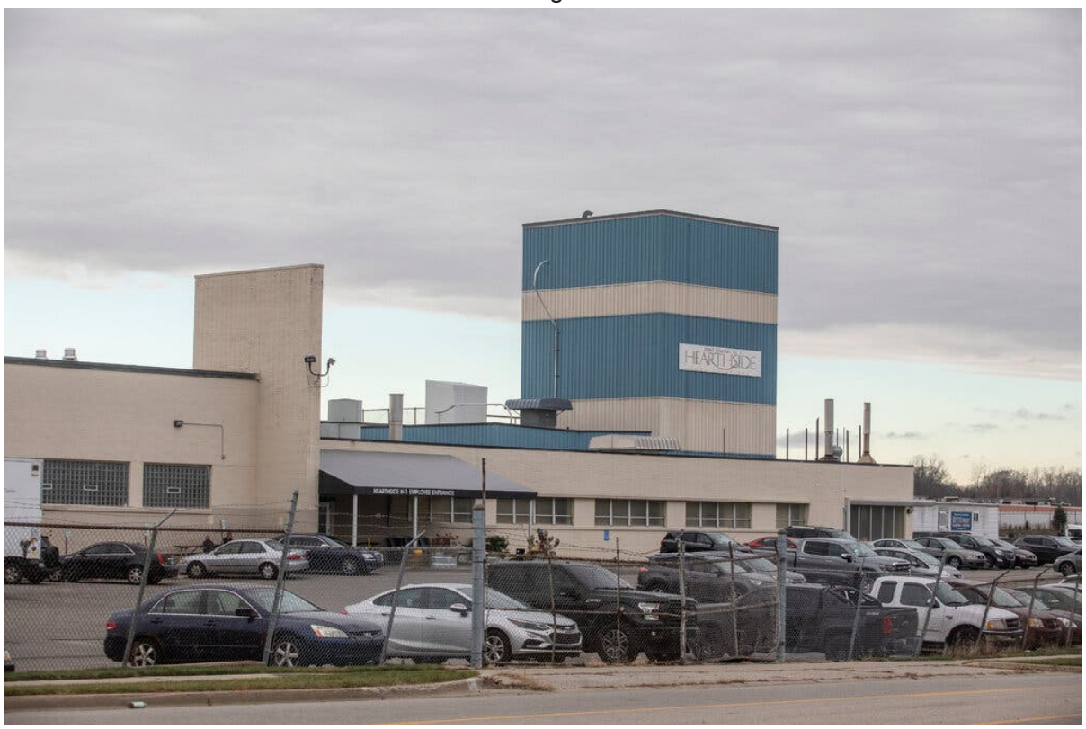
Hearthside Food Solutions, one of the United States' largest food contractors, makes and packages products for well-known snack and cereal brands.

These workers are part of a new economy of exploitation: Migrant children, who have been coming into the United States without their parents in record numbers, are ending up in some of the most punishing jobs in the country, a New York Times investigation found. This shadow work force extends across industries in every state, flouting child labor laws that have been in place for nearly a century. Twelve-year-old roofers in Florida and Tennessee. Underage slaughterhouse workers in Delaware, Mississippi and North Carolina. Children sawing planks of wood on overnight shifts in South Dakota.